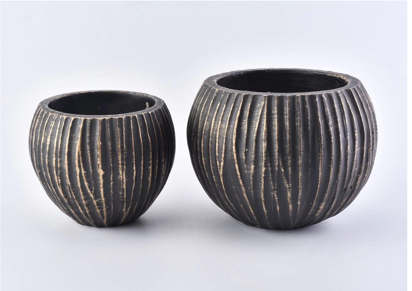
Office & Sample Room