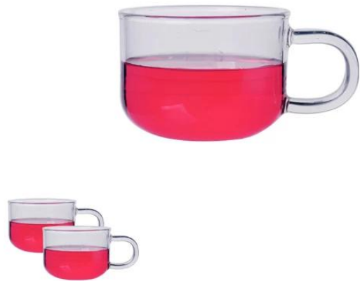
borosilicate single wall glass