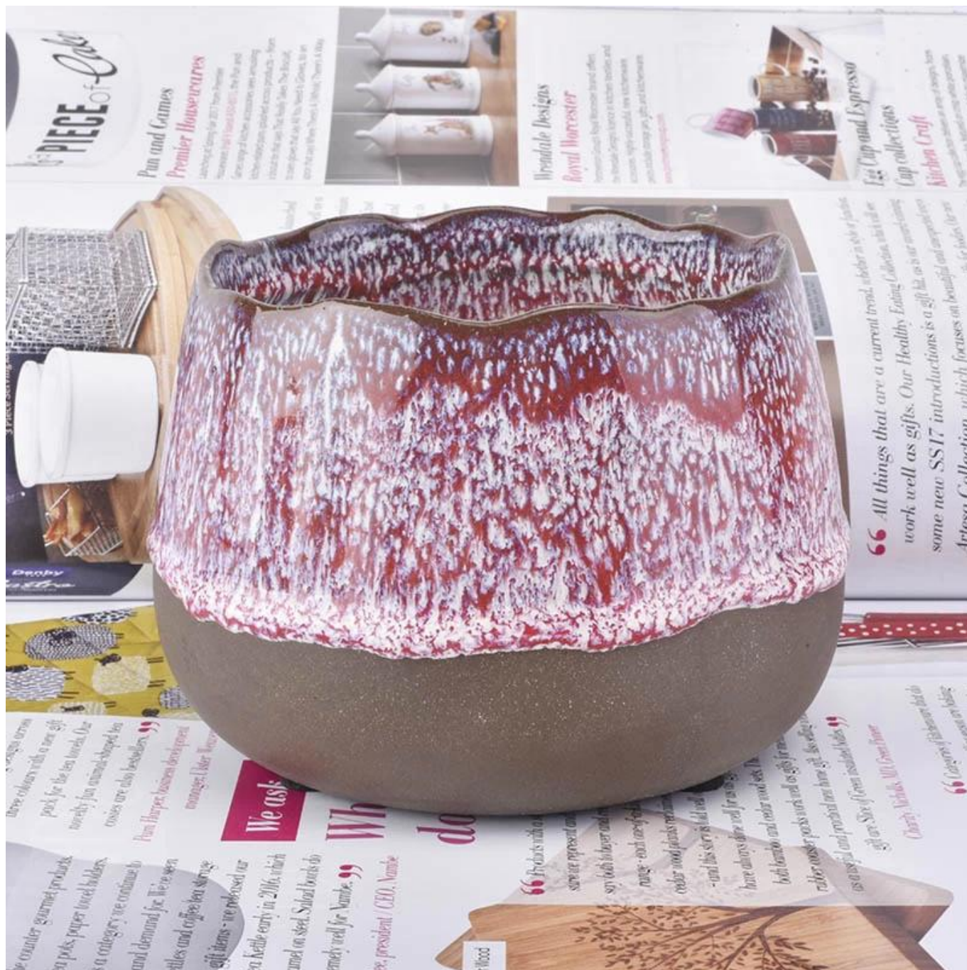
Office & Sample Room