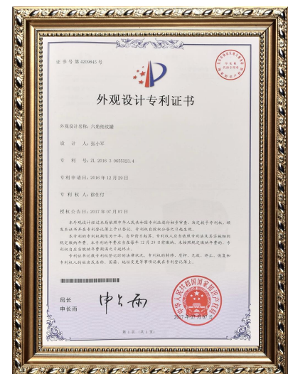
Patent Number: 201630655323.4