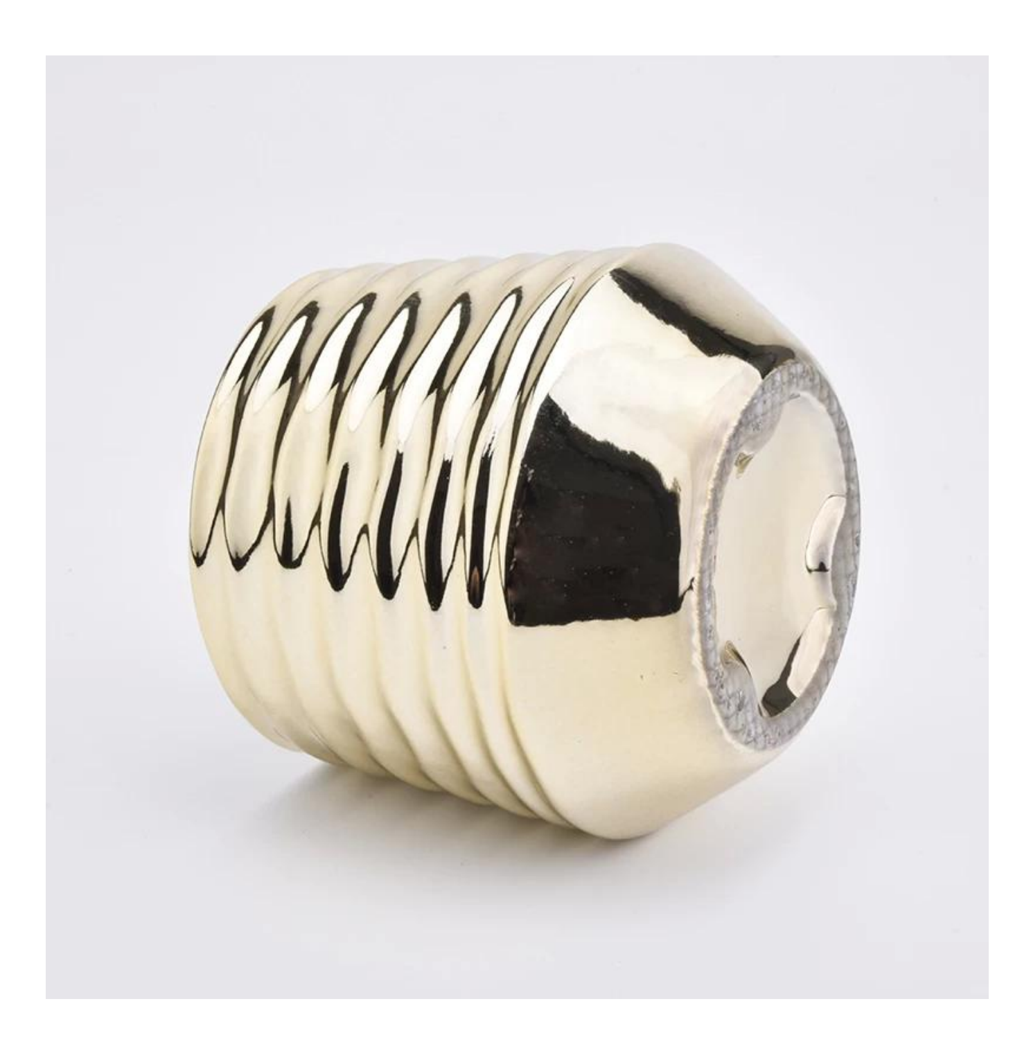
Packing & Shipping