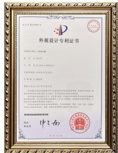
Patent Number: 201630655323.4