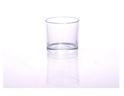
machine made glass candle holder