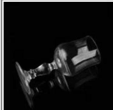
glass candle holder