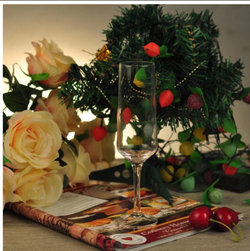
Champagne glass cup