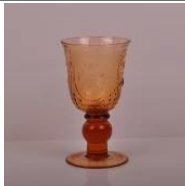
mother crystal chandelier