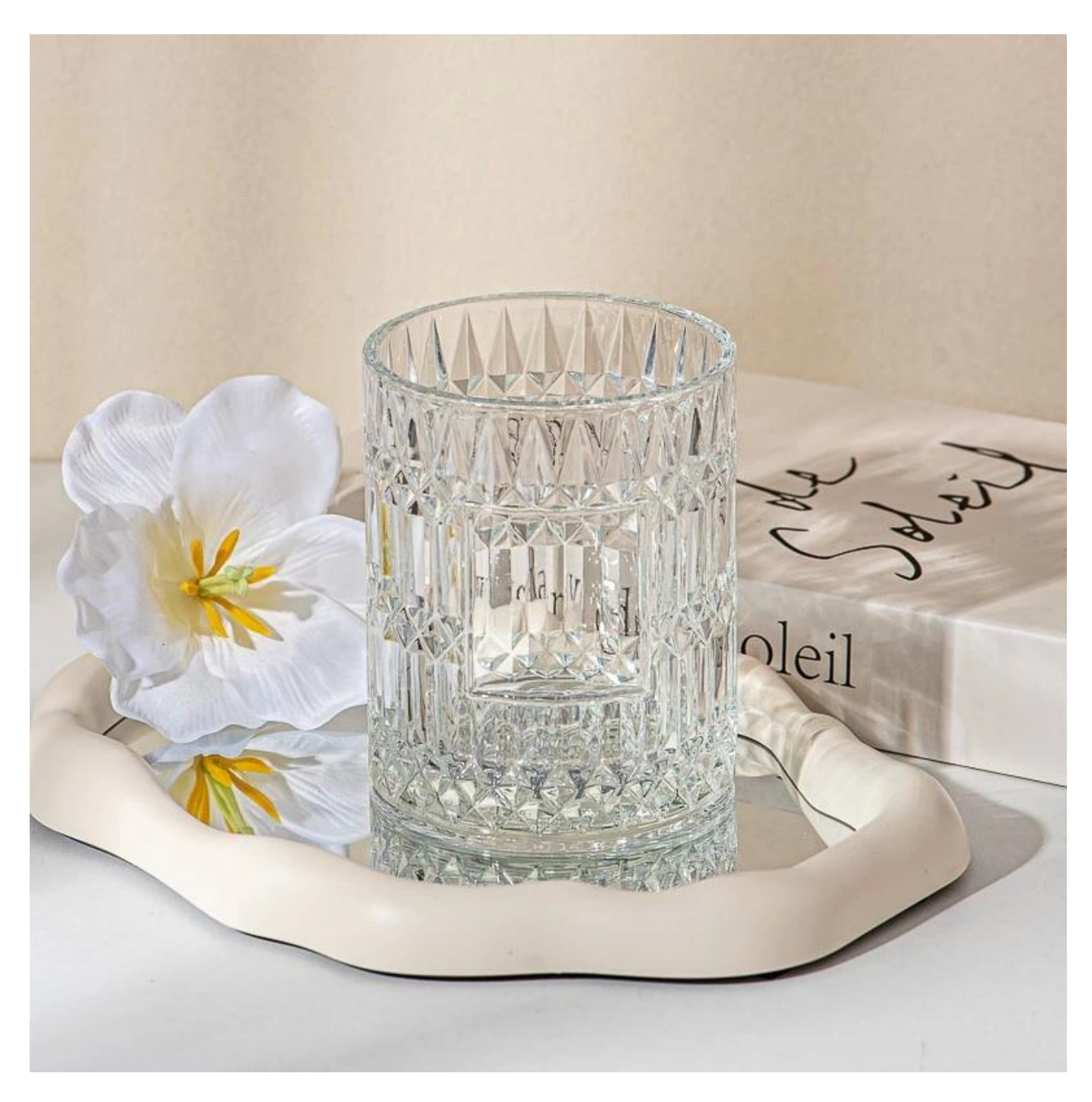
Illuminate your space with this exquisite machine press <u>candle glass jar</u>! Featuring a exquisite relief patterns, it creates mesmerizing light reflections.