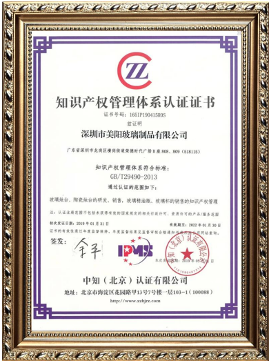
Company intellectual properties