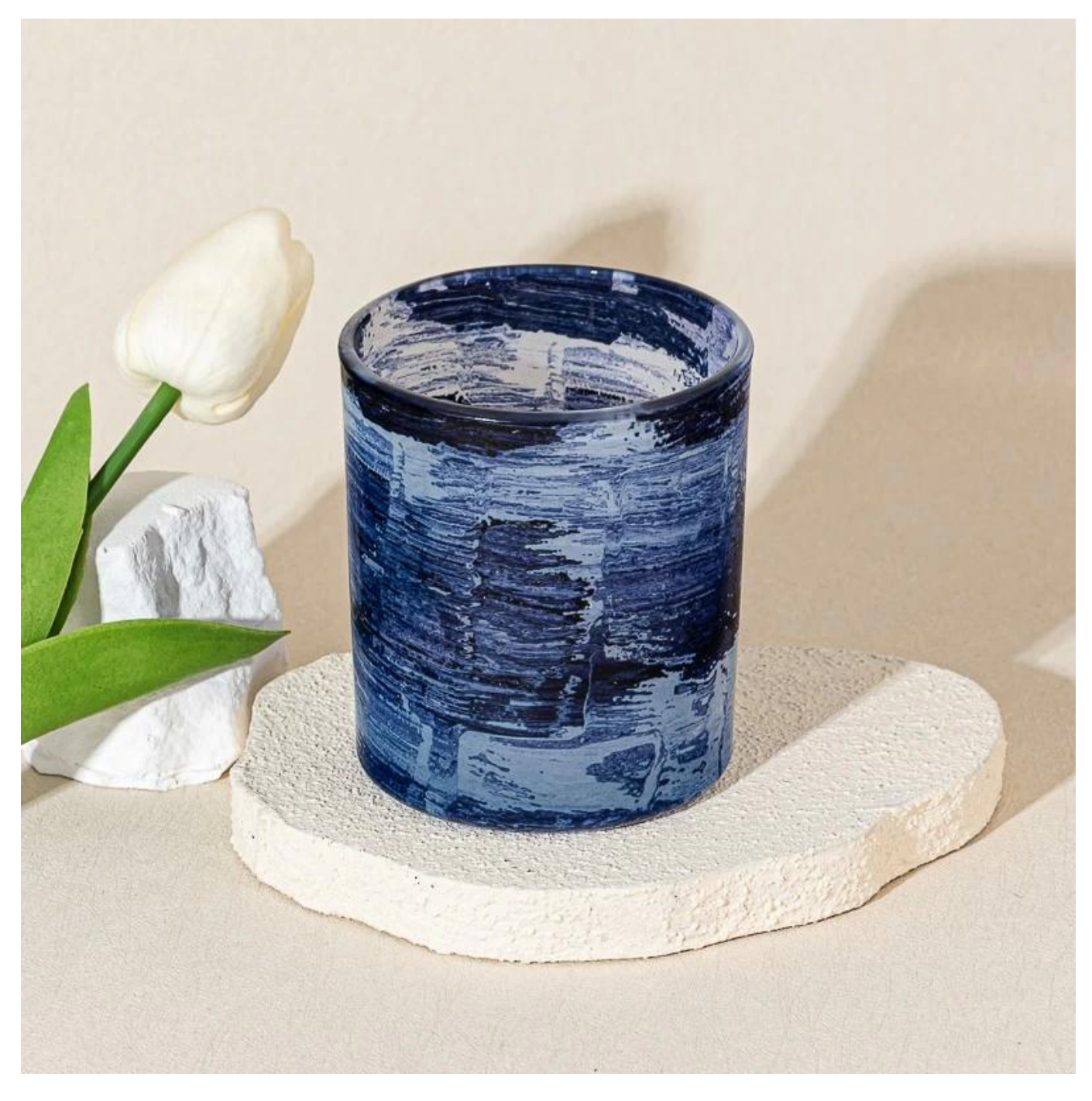
Add a touch of artistic elegance to your space with our blue brush-stroke <u>glass</u> <u>candle holder</u> — where modern design meets calming ambiance.