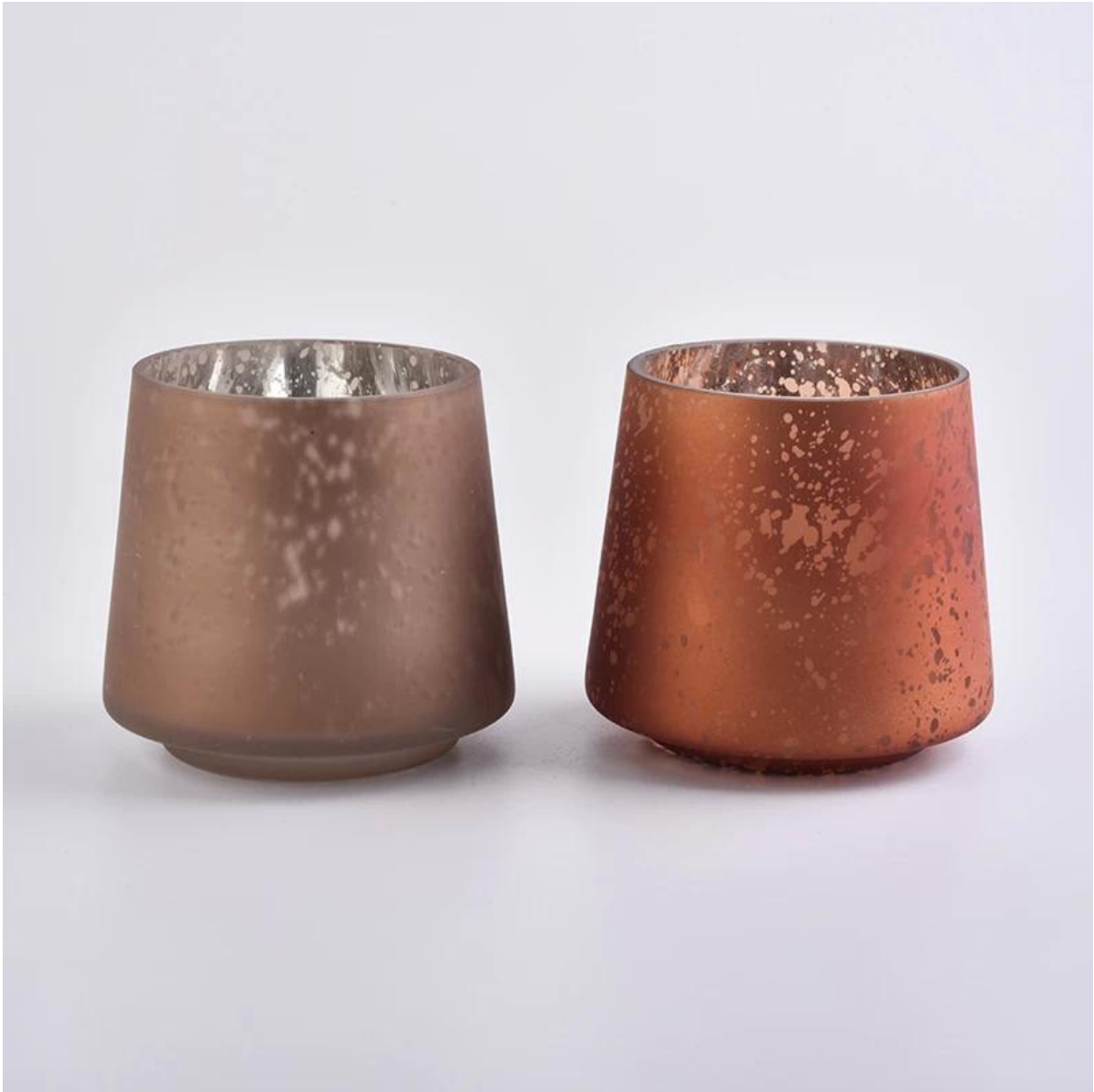
Sunny Brand Story