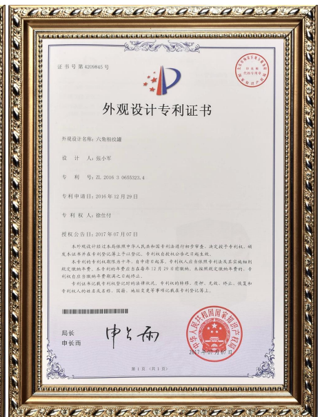
Patent No.: 201630655323.4