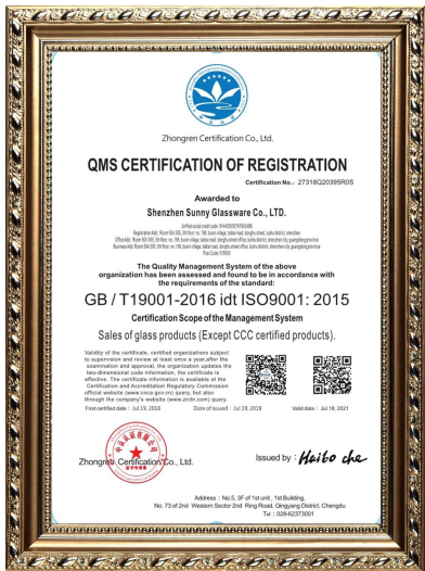
ISO 9001: 2015