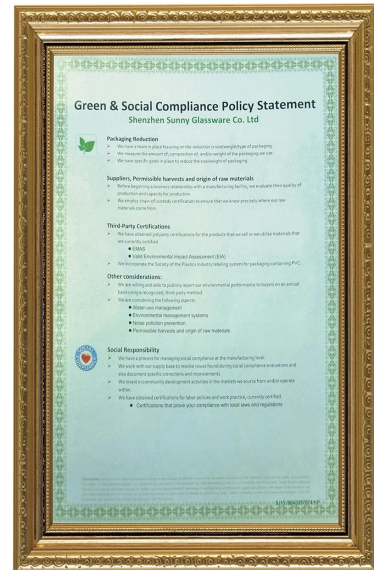
Green and social responsibility Policy's statement