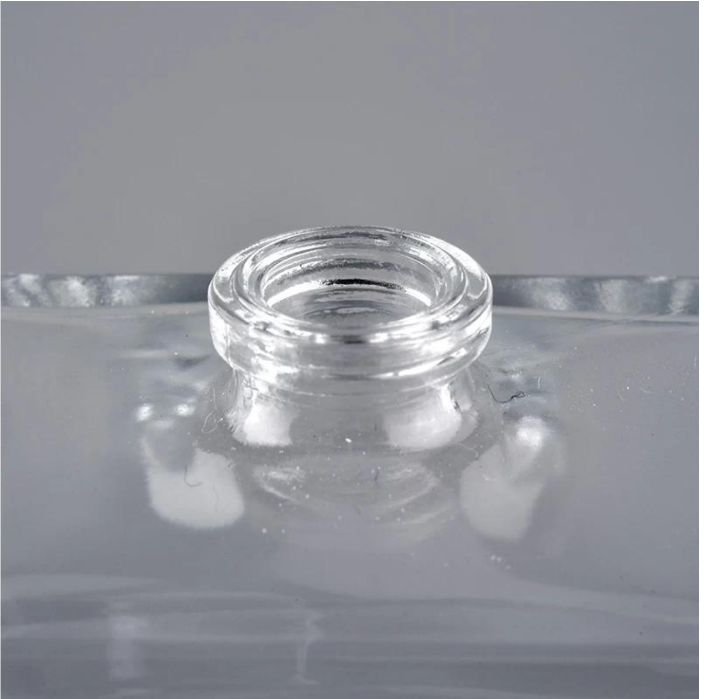
Packaging & shipment