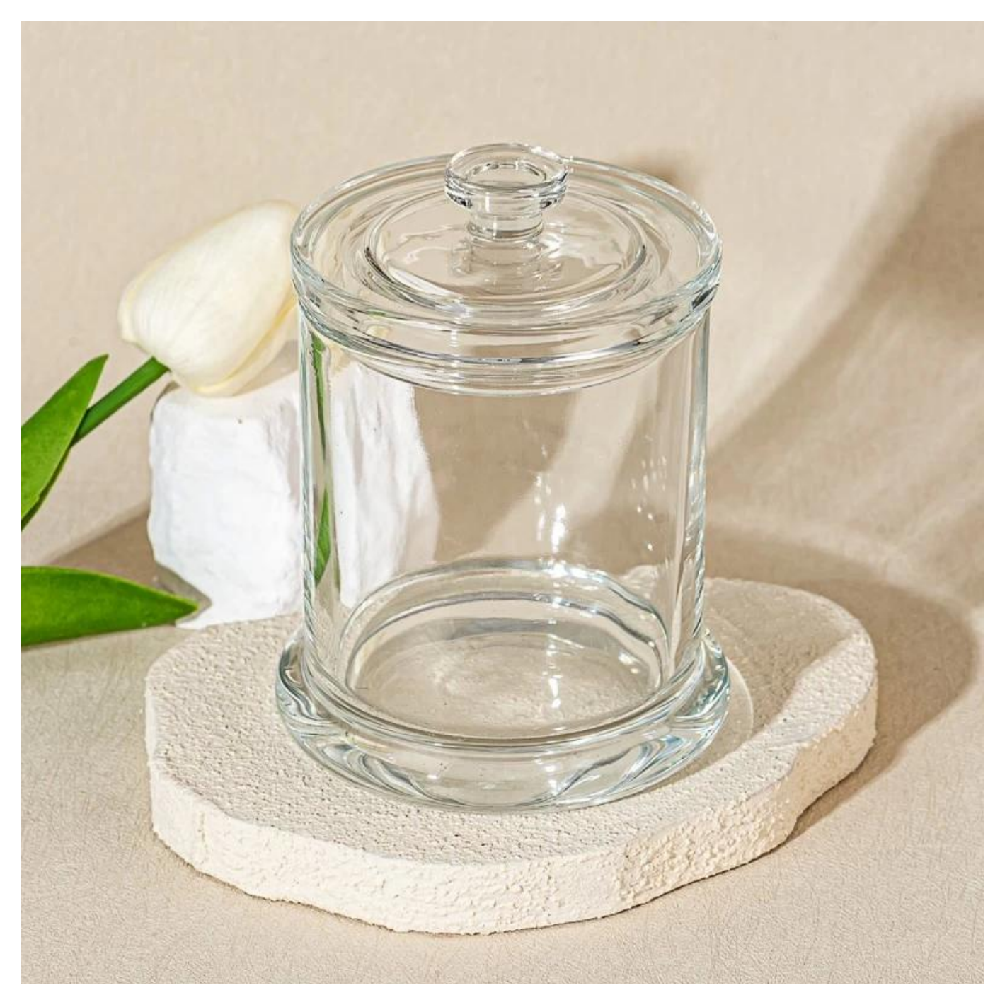
Elegant simplicity meets practical charm — this I-shaped clear <u>glass candle</u> <u>jar</u> with lid adds a touch of timeless beauty to any space. Perfect for showcasing your favorite scented candles with style.