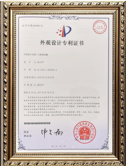
ISO 9001: 2015 Corporate intellectual property Patent no.: 201630655323.4