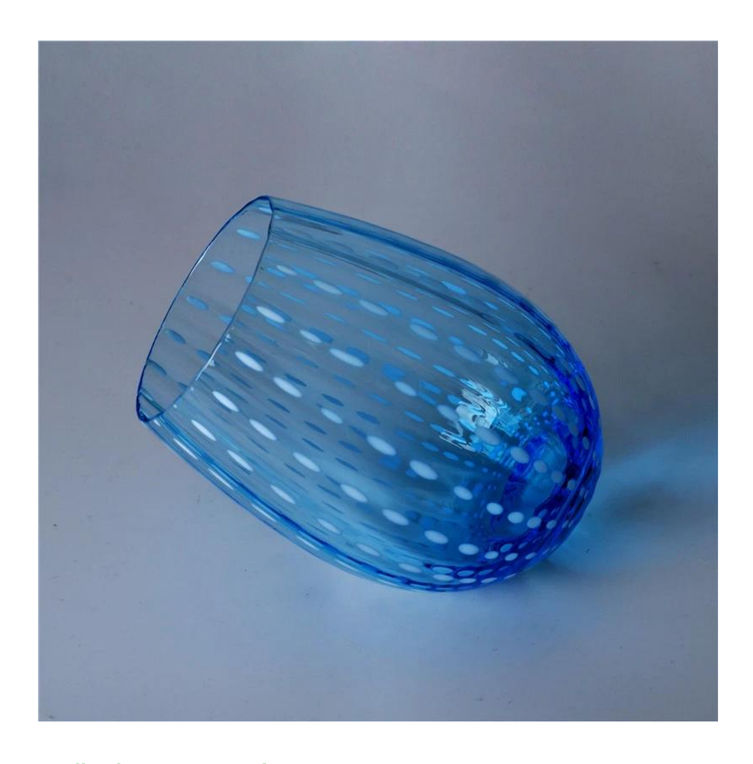
Mutli Color For Your Ref.