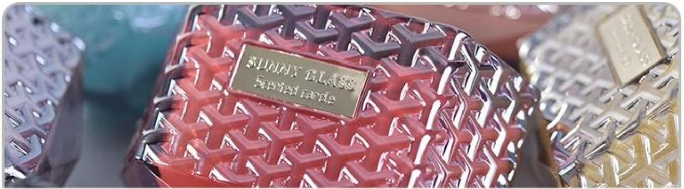
Glass Candle Holders