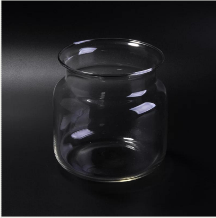
Mouth blown glass jar for home fragrance