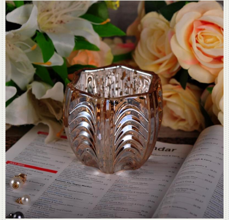
Luxury gold color votive glass candle jar