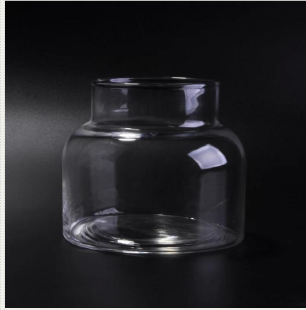
Clear large capacity glass jar for candles