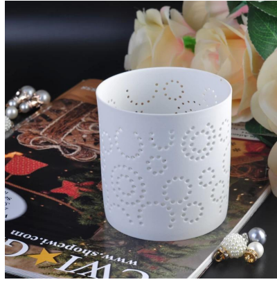
Cylinder white ceramic vessels