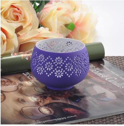
Ceramic candle jars wholesale