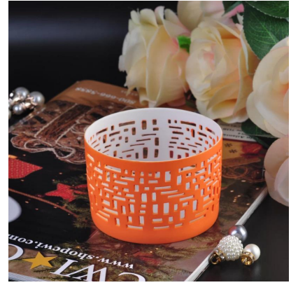
Colored votive holders wholesale