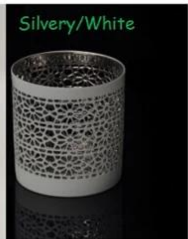
Item No.: SGJH15112209