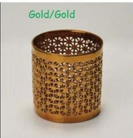
Item No.: SGJH15112208