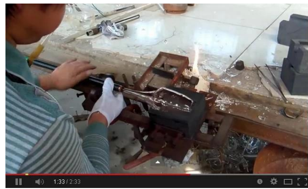
IS machine technology