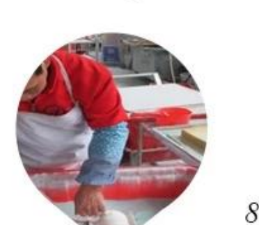
8. Glazed Firing