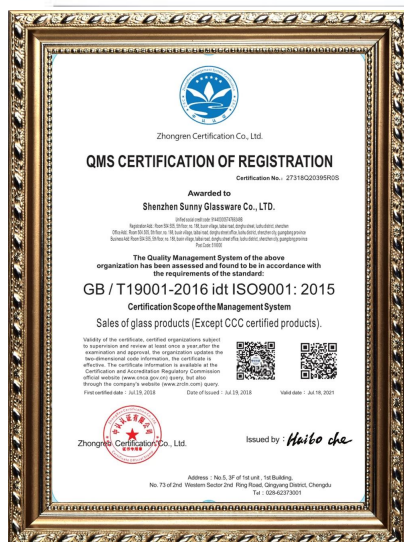
ISO 9001: 2015