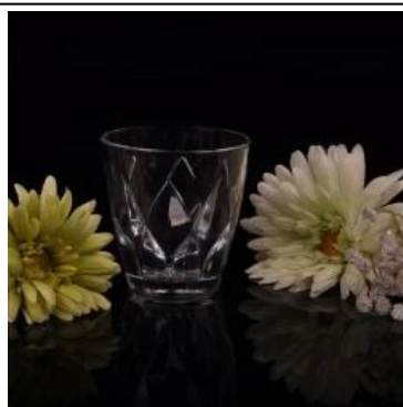
Personalized whiskey glass