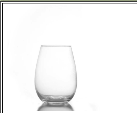
stocked machine blown stemless wine glass