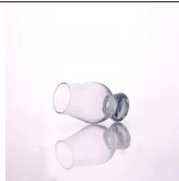
stemware beer glass