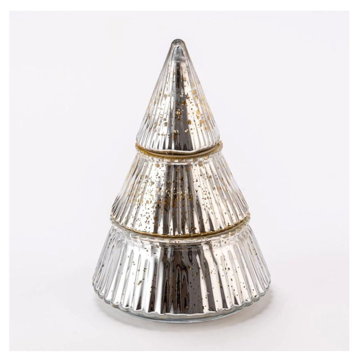
This Christmas tree-shaped <u>glass candle holder</u> is made of two jar layers and a pointed lid. The inside is coated with silver flakes that shine like stars.