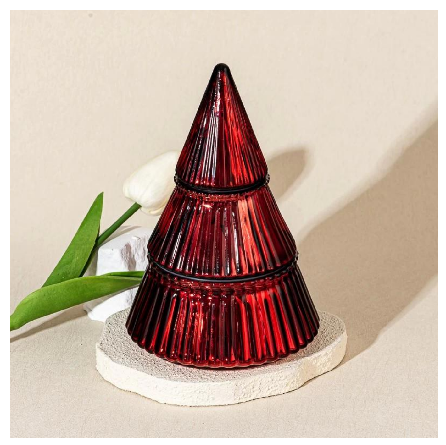
This Christmas tree-shaped glass\ candle\ holder is made of two jar layers and a pointed lid.

The inside is coated with silver flakes that shine like stars.