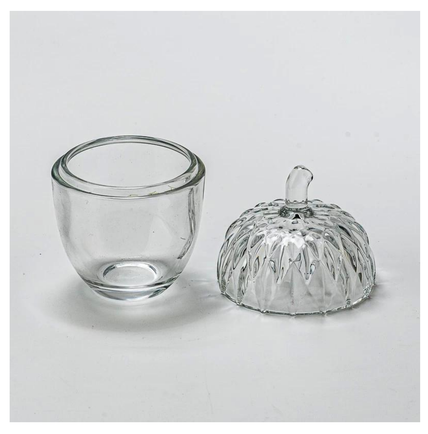
Acorn \underline{\text{glass candlestick}} \cdot \text{Hide the light of the forest in the jar}

The glass-like shape restores the full curvature of acorn. When the candle flame is lit, the light refracts between the wavy glass, casting a soft light filter like the morning mist in the forest.