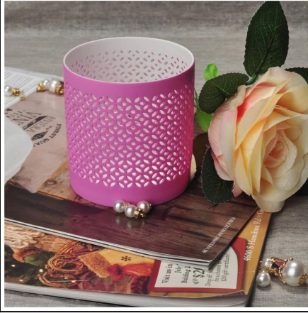
Lovely Pink Heat Resistant Hollow Ceramic Candle Jar