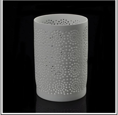
Matte White Ceramic Candle Jar Wholesale