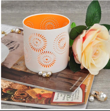
Ceramic Candle Jar Wholesale Painted Interior