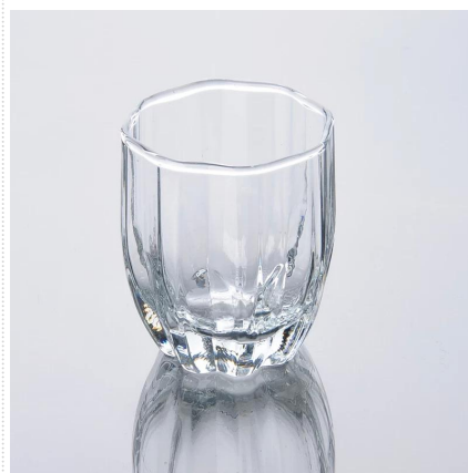
popular promotional glass