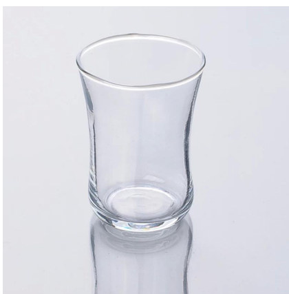
latest design glass cup