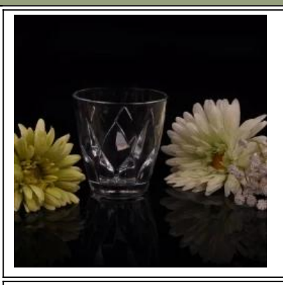
Personalized whiskey glass