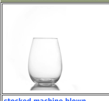
stocked machine blown stemless wine glass