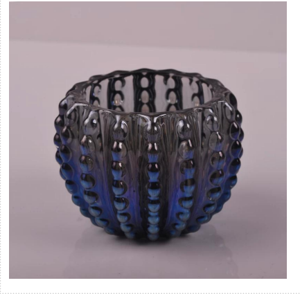
glass stripe dot candle holders