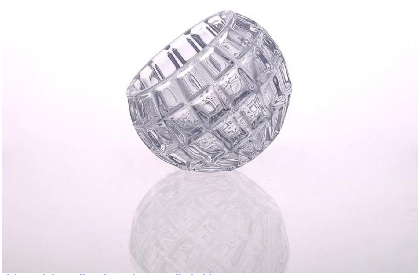
title="High quality clear glass candle holder