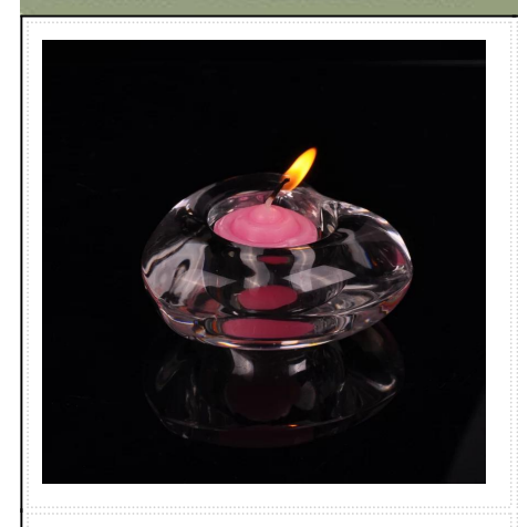
heart shape glass candle holders