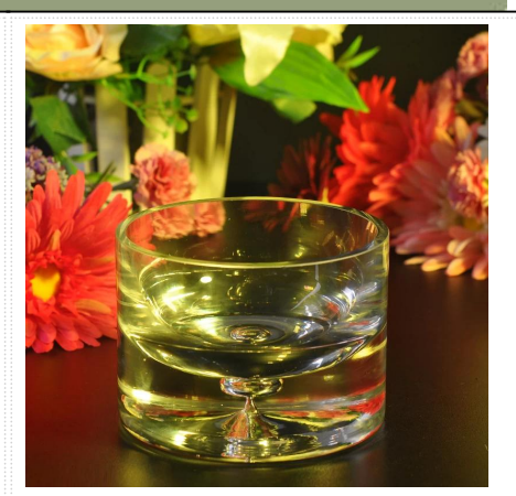
candle holder glass water drop