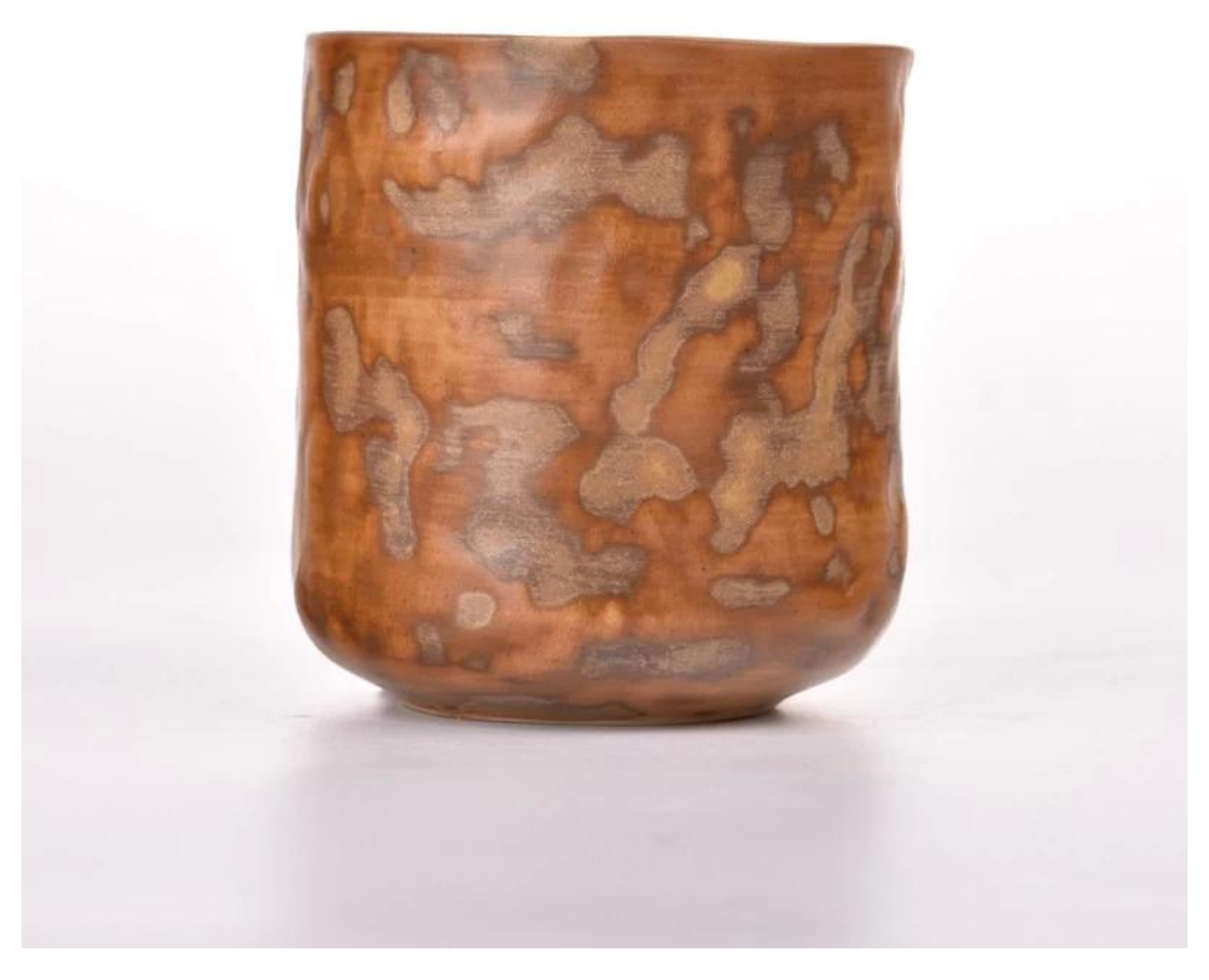
Handcrafted clay \underline{\text{candle jar}} \times \text{naturally rusted glaze} Every mottled spot is an accidental result of the kiln transformation, and the smooth touch conceals the warmth of the artisan's fingertips.