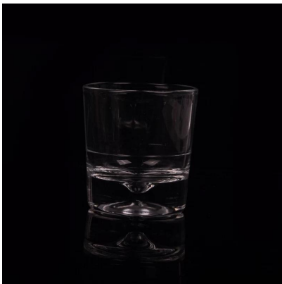
Clear Water Cup