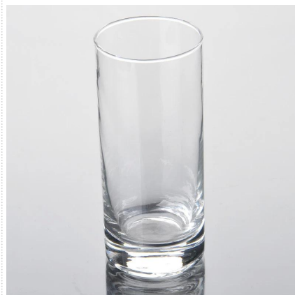
Simple clear glass tumbler cup