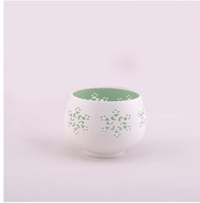
hand made ceramic candle holder