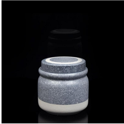
Ceramic candle holder with marble finish