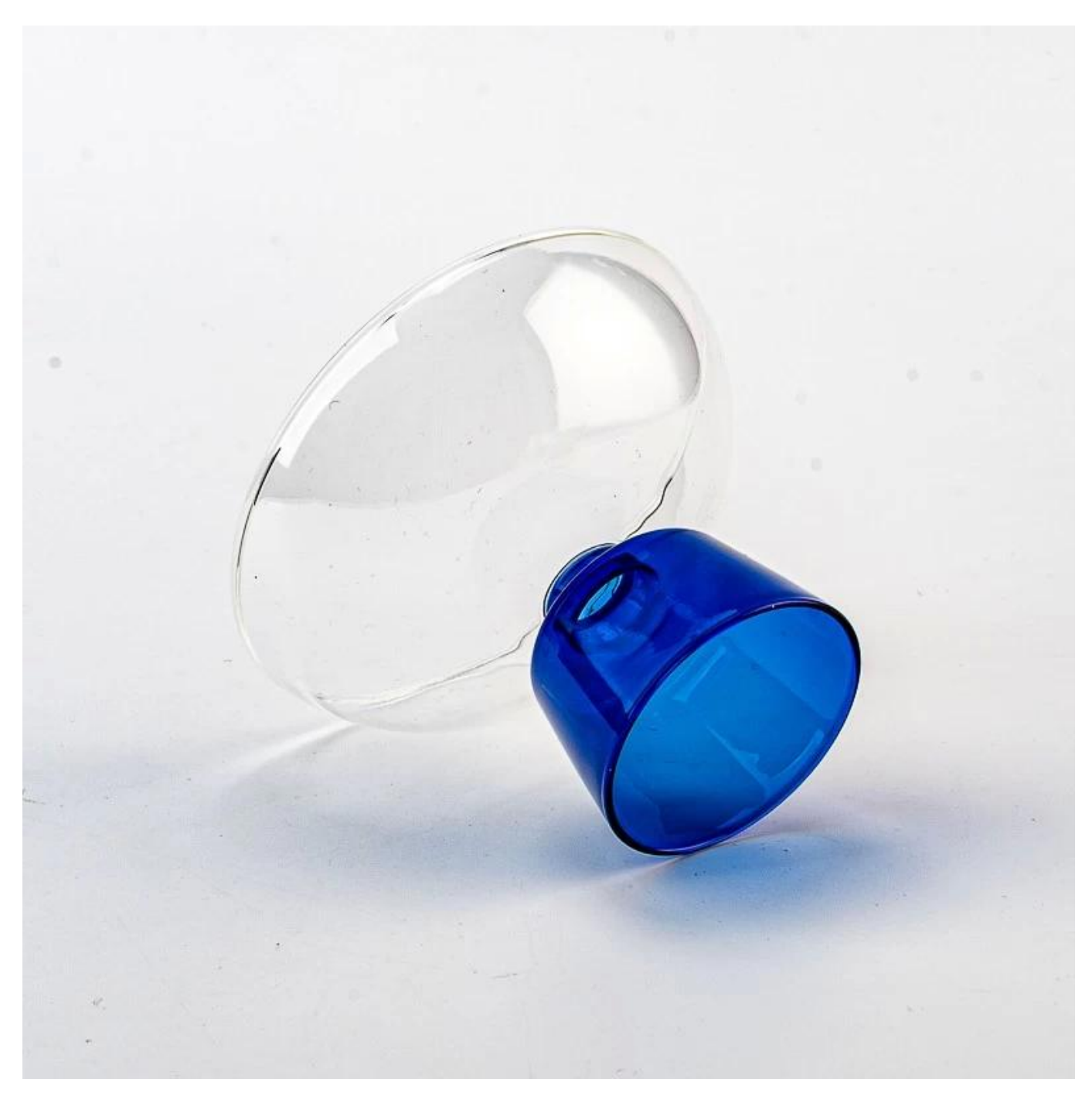
This round bowl-shaped <u>candle holder</u> with a base is crafted from high borosilicate glass, offering a clear, elegant look.