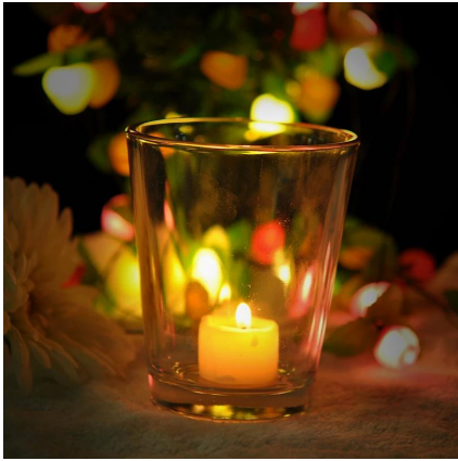
High light candles holder V Shape