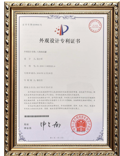
Patent No.: 201630655323.4