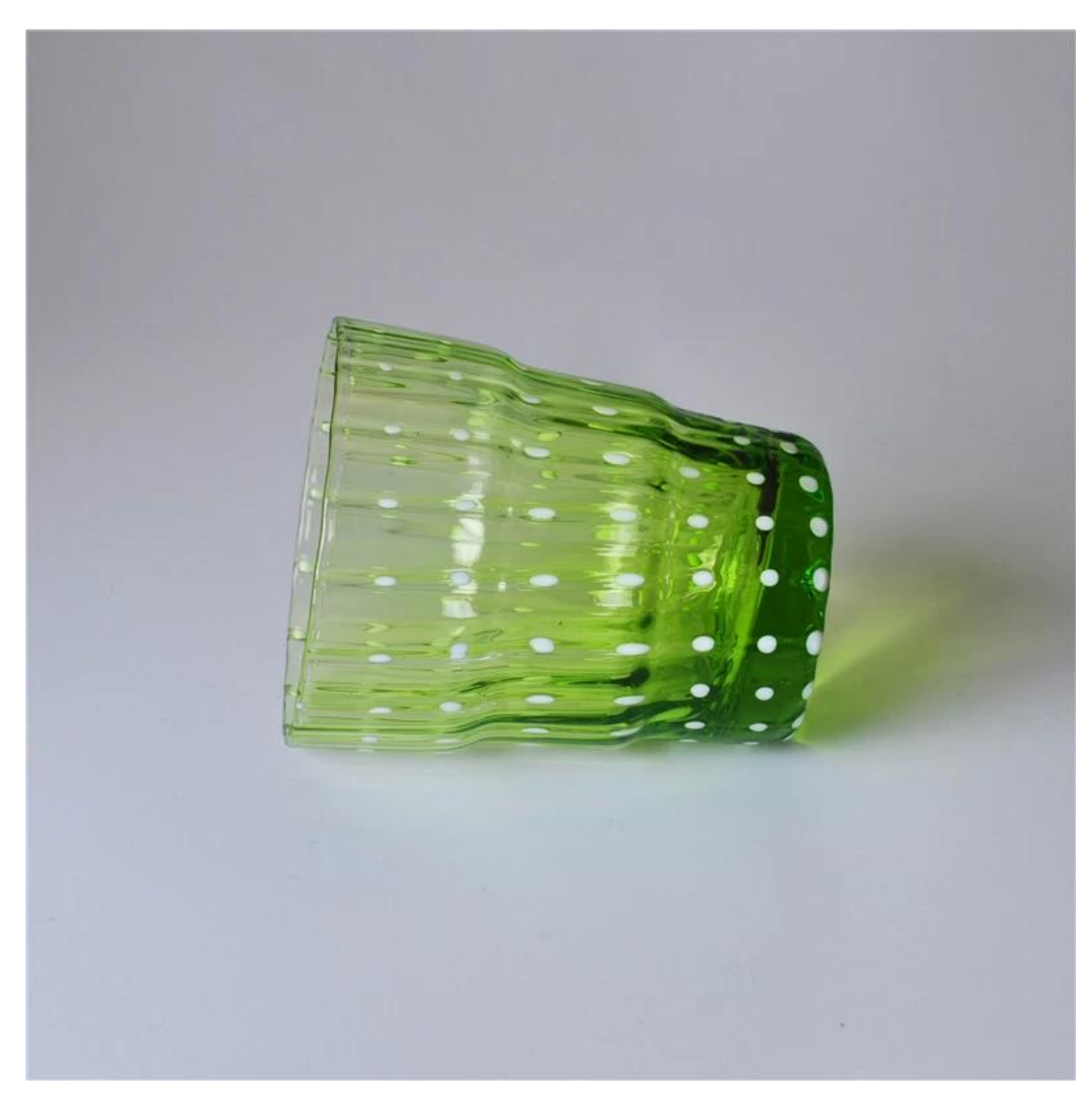
Mutli Color For Your