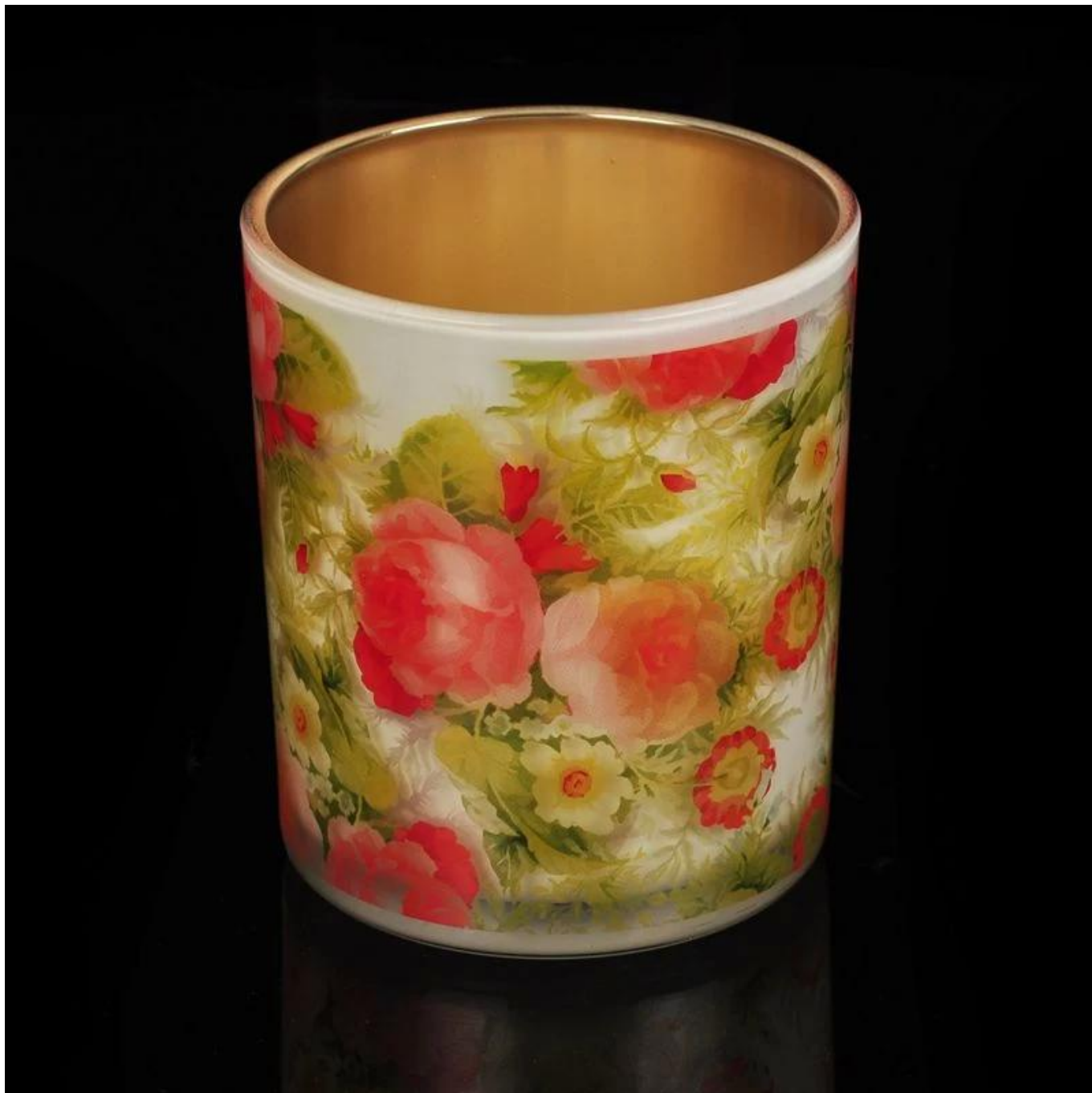
Candle lids accessories: