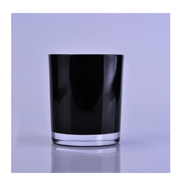
Packing & Shipping