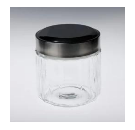
Candy glass jar