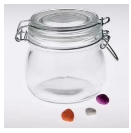
Customized glass storage