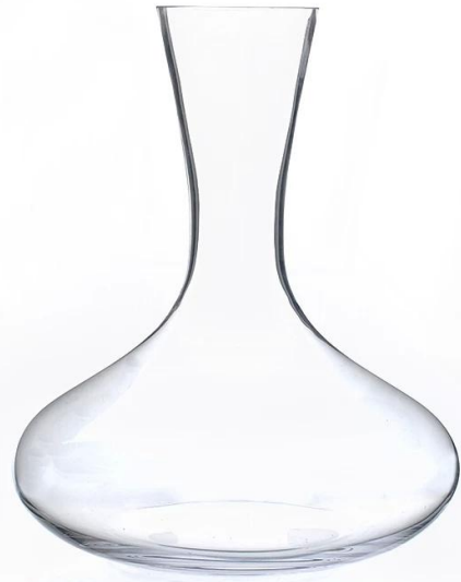
Glass round bottom decanter