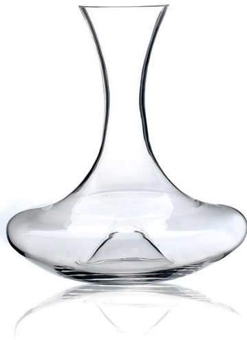
1737ml wine decanter