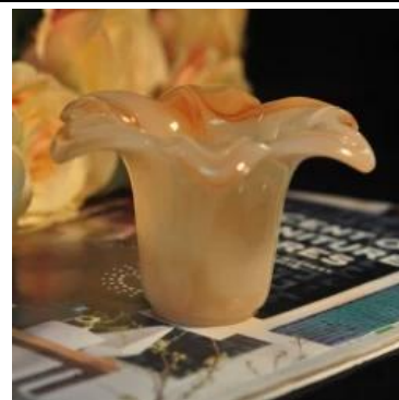
Flower shape cylinder jade amber color decorative glass candle jar candle holder