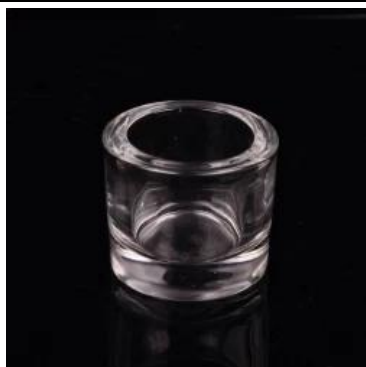
Cylinder tealight candle holder