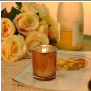
140ml Copper Candle Jar