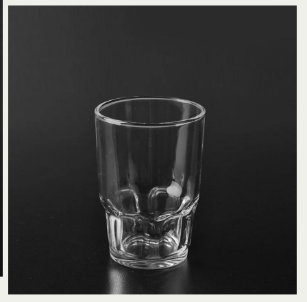
clear glass new design glasses