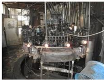
☐ Machine Blown