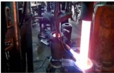
☐ Machine Pressed