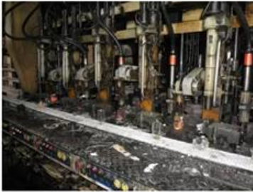
☐ IS Machine