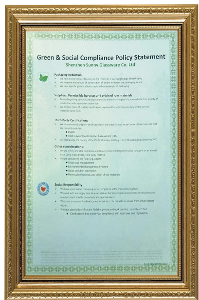
Green&Social compliance Polidy Statement