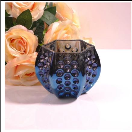
high quality wedding candle holder